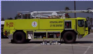
PowerFlare Safety Light being run over by an E-1 Titan fire truck