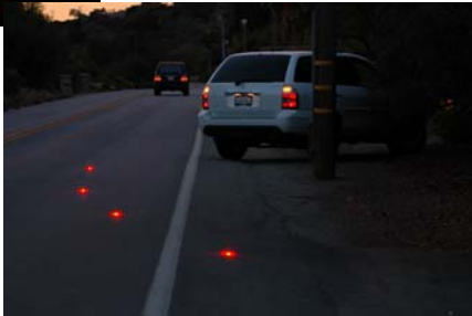
PowerFlare lights deployed on road for traffic control