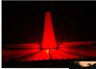
PowerFlare light under a traffic cone

Two zippered compartments. One for the Safety Lights and one for extra batteries and allen wrench.